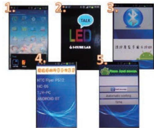
Fig.3 > APP operation

Considering the mobility of the bulletin board, there are two options of electric power for the system. Users can choose AC or portable power according to demands.