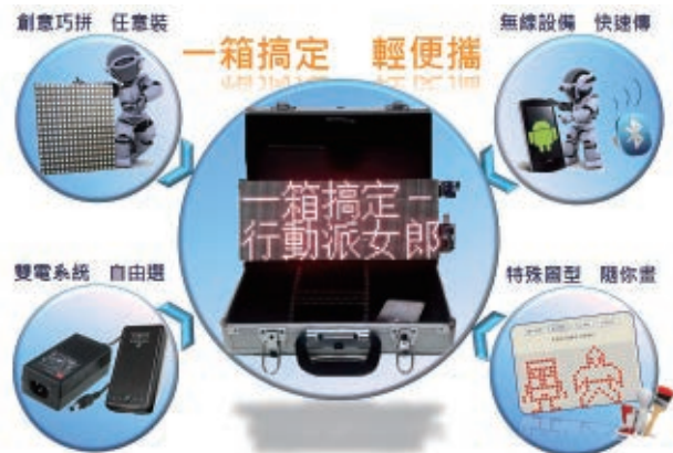
圖2 > 特色說明圖