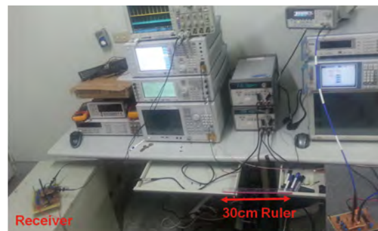
Fig. 3 / Measurement setup