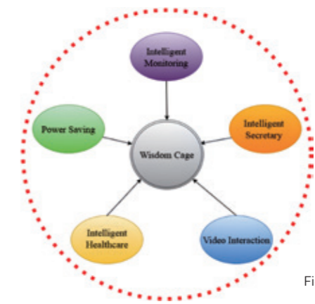
Fig 2. The proposed system diagram

These functions are modular design, so owner can choose required modules needed. Compared to other market customized cages, the costs of this system is significantly low, enough to reduce the threshold of getting a high tech customized cage. That makes dog cage cover the full range of unique dog care and help to provide a more safe and healthy environment. Moreover, it helps to reduce the burden on pet owners and solve the problem caused by that owners have no time to accompany their dogs.